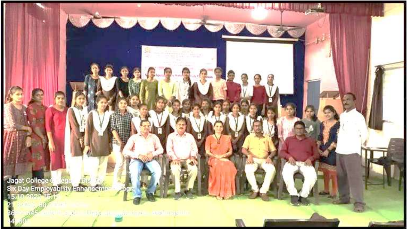
Jagat College College of Dis. Tech. Six Day Employability Enhancement Program 15.10.2022-16.11 21, 20000330, 20000330 8664-645-20000330, 20000330, 20000330 14, 80